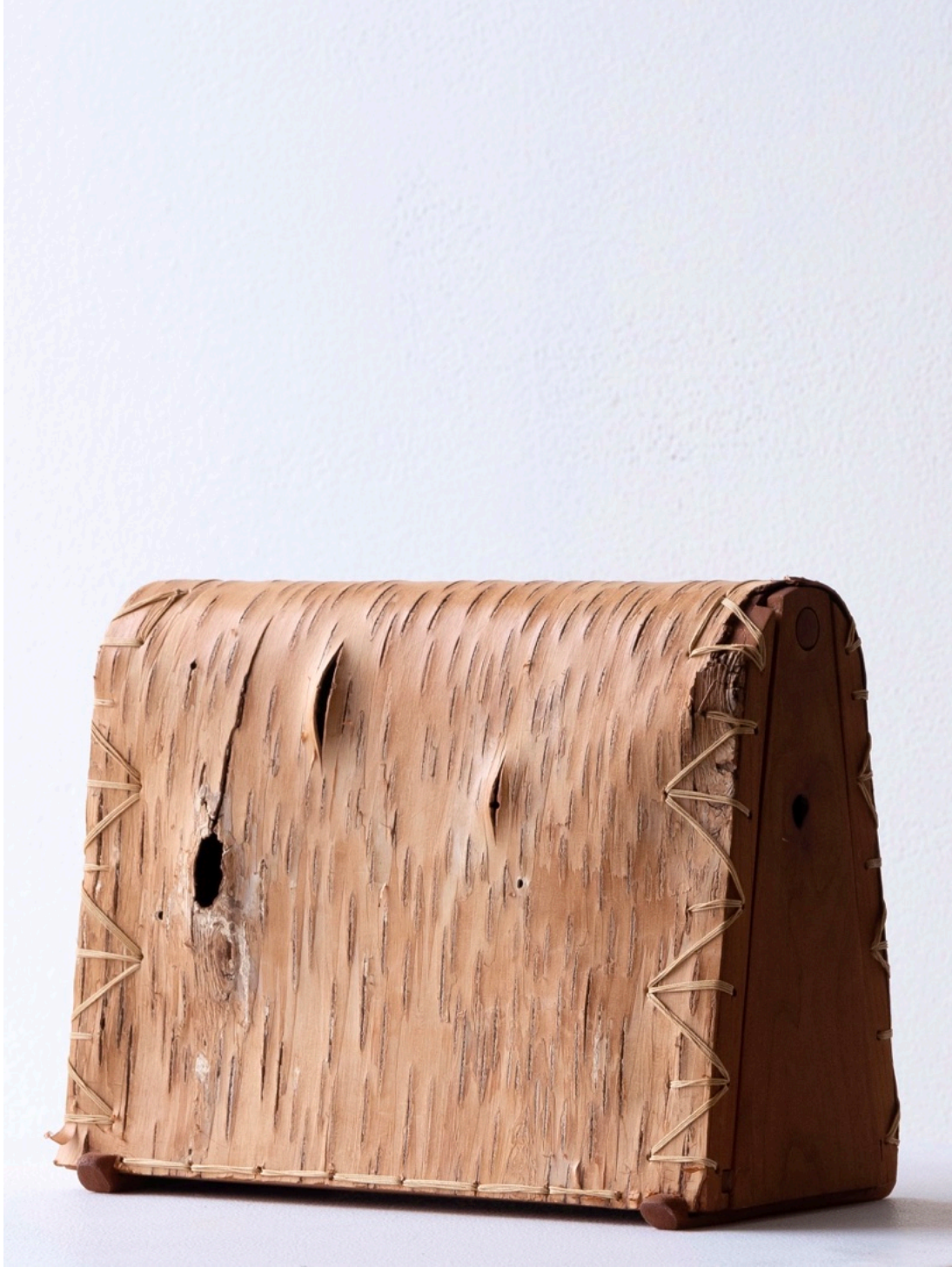
Data Islands: Providence Wifi Router, 2021 , birch bark, linen thread, cherrywood wifi router.

This router is part of the Data Islands series, which explores craft, materials, and global connectivity. Each router in Data Islands is crafted with region-specific materials and techniques, connecting hyper-local creations to a global social network.