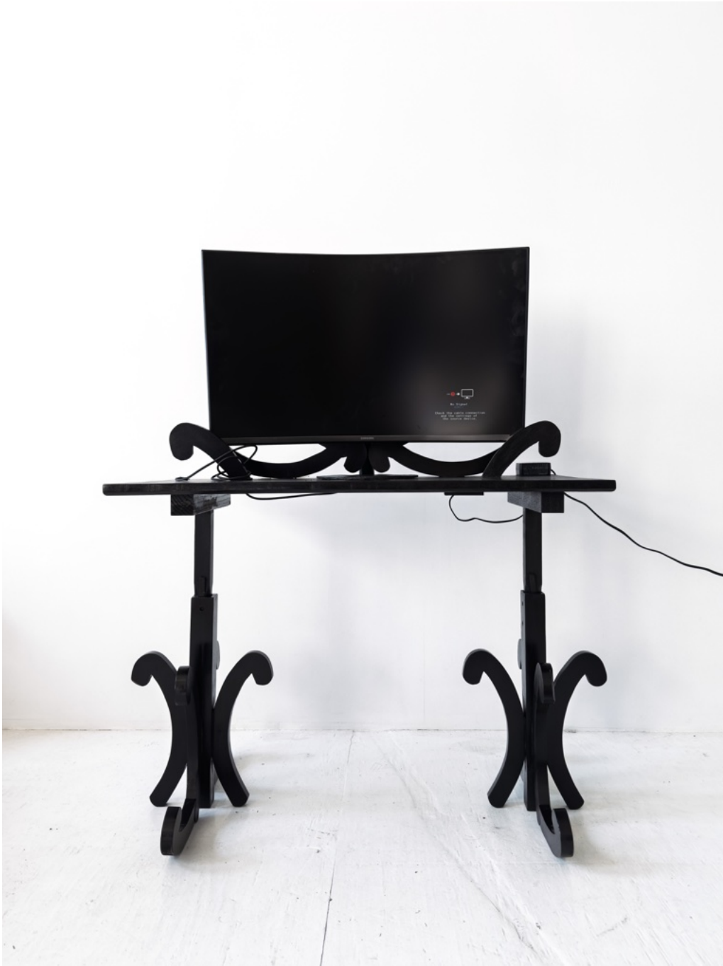
Monitor Vanity #3, 2025, stained oak and sycamore wood, curved Samsung monitor (30"). 48" L x 30"W x 28-30" H (adjustable)

Combining 18th-century settler folk furniture from Ontario, Canada, with 21st-century PC gaming setups, this desk/vanity merges two maker-driven traditions. One offers design solutions ripe for reinvention, while the other proves that craft thrives wherever people build for themselves. Folk craft isn't dead—it just swapped chisels for RGB lighting.