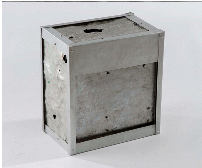
Grafted PC, 2022, aluminum, PC parts.

This personal computer embodies the ethos of gleaning, exploring the worlds of modern PC culture and traditional craft. Its exterior shell is crafted from reclaimed aluminum and a computer case salvaged from a scrapyard. The hammered patterns on the case mimic the texture of tree bark, drawing inspiration from birch bark boxes—a form of craftsmanship with a history spanning millennia across the northern hemisphere. The contrast of references highlights how digital culture could choose to intersect with the tactile, time-honored practices of handmade craft and bring a holistic framework to digital technology.