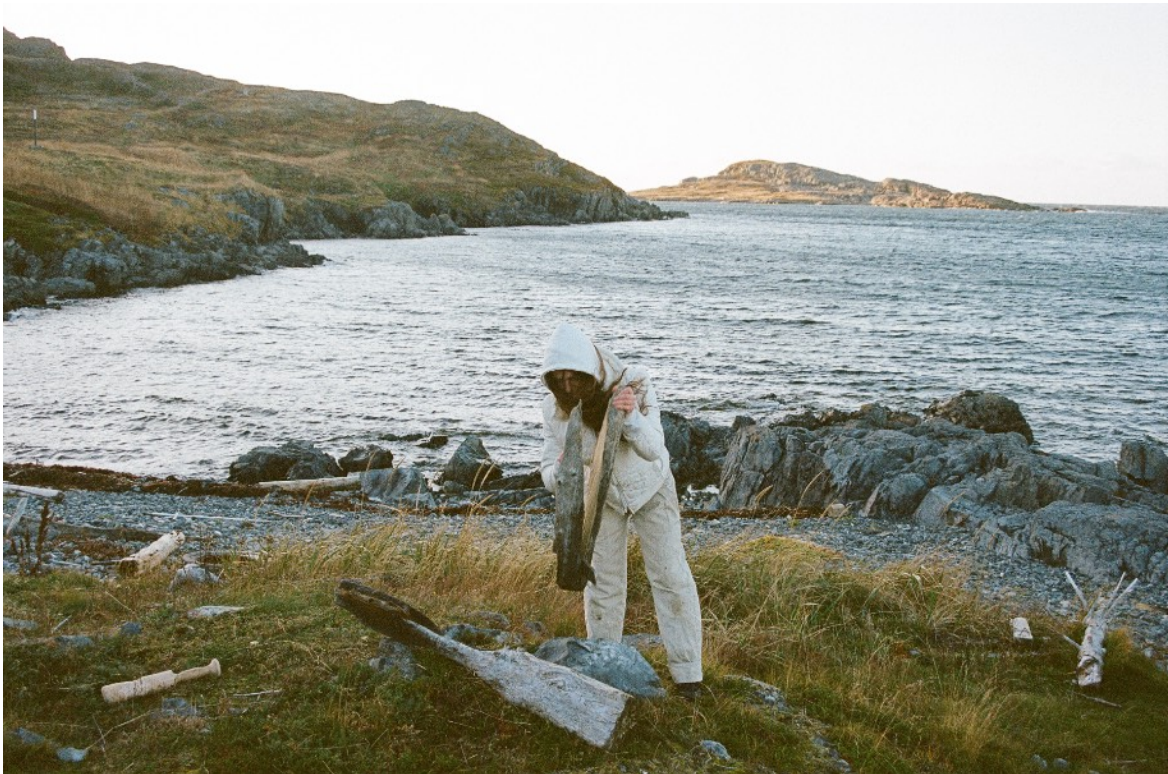
Documentation of Fogo Island Stool and Router, 2024. 30 mm film.

On the edge of Fogo Island, these photographs capture the process of gleaning materials from roaming the islands' coast. Pictured here an eroded pole, assumed to be a piece of an old boat, is broken into usable boards with a froe.