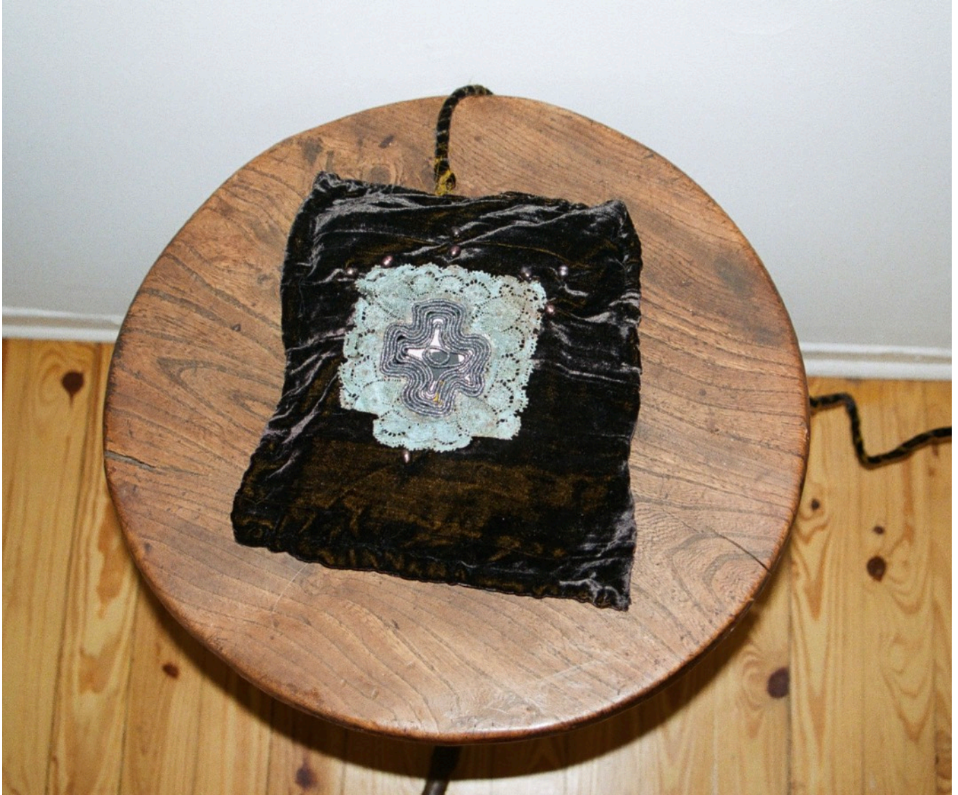
Wireless Phone Charger, 2024, silver-plated copper, electronics, velvet and pearls. 8" x 8" x 5/8"

The cultural weight of an object lies in its materials, production, and acquisition. A mass-produced wireless phone charger, ordered online and stripped of human touch, reflects a disposable ethos. Contrast this with a phone charger crafted from silver and pearls—materials steeped in the traditions of fine jewelry. This fusion of cheap electronics and opulent ornamentation challenges us to rethink the cultural significance of objects and embolden longevity and repair of domestic technology.