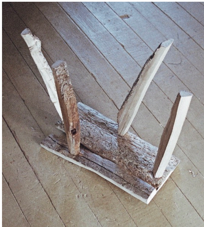
Fogo Island Stool, 2024, salvaged lumber, 8" x 14" x 12".

Erosion patterns of rocky shores of Fogo Island find kinship to the weathering of scavenged wood resting on the rock beach. This wood's exterior, scarred by time and exposure, contrasts sharply with its untouched inner grain, revealing a stark divide between what is near and what lies hidden. This interplay between the familiar and the alien transforms the island's landscapes and materials into a meditation on time, connection, and the unseen unity beneath apparent dissonance.