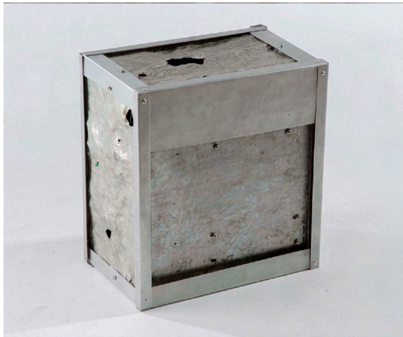
Grafted PC, 2022, aluminum, PC parts.

This personal computer embodies the ethos of gleaning, exploring the worlds of modern PC culture and traditional craft. Its exterior shell is crafted from reclaimed aluminum and a computer case salvaged from a scrapyards. The hammered patterns on the case mimic the texture of tree bark, drawing inspiration from birch bark boxes—a form of craftsmanship with a history spanning millennia across the northern hemisphere. The contrast of references highlights how digital culture could choose to intersect with the tactile, time-honored practices of handmade craft and bring a holistic framework to digital technology.